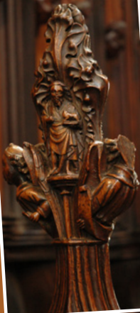
John the Baptist

But they still looked as though they were standing up. So these ledges were called "kindness" or mercy-seats. (In Latin, the language used in churches then, miseri means mercy, cord means seat). The ledges underneath were not normally seen. So the men who carved them sometimes put funny designs there, or scenes from everyday life.