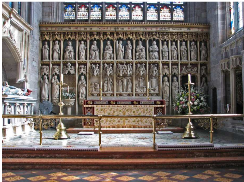
When restored and cleaned, the gilding on the reredos will once again shine out gloriously