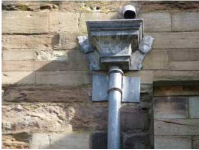
A beautiful new hopper