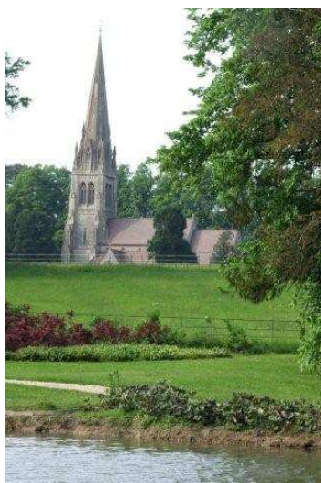
Holy Innocents Church, Highnam