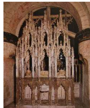
Tomb of Edward 11