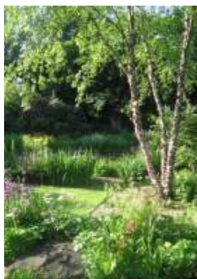
The water garden