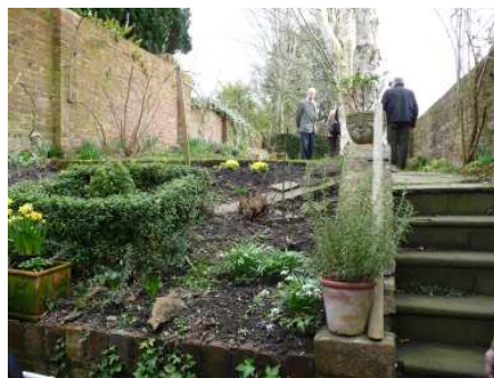
A glimpse of the garden from the back of the house