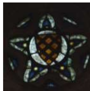
The arms of Theobald de Verdun (c 1316)